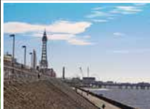
Churches Trip to Blackpool