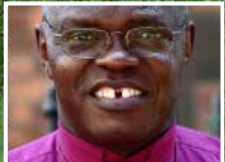
Crossroads Mission Weekend