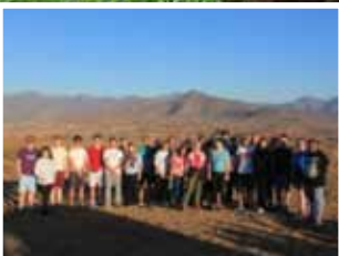
Youth Mission to South Africa